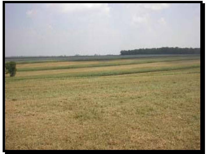
Field in Finger Lakes Region

The convention continued with great speakers, some with strong and passionate messages, some with thought provoking messages. Networking opportunities abounded with an extraordinary gathering of state, national and international leaders. The whole experience was a great mix of learning and fun.